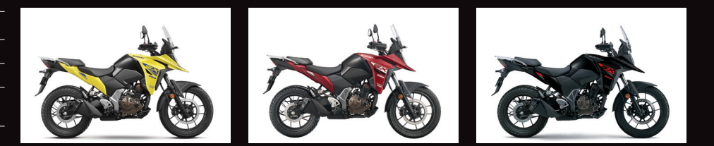
Champion Yellow No.2 (YU1) | Met. Sonoma Red | Glass Sparkle Black (YVB)