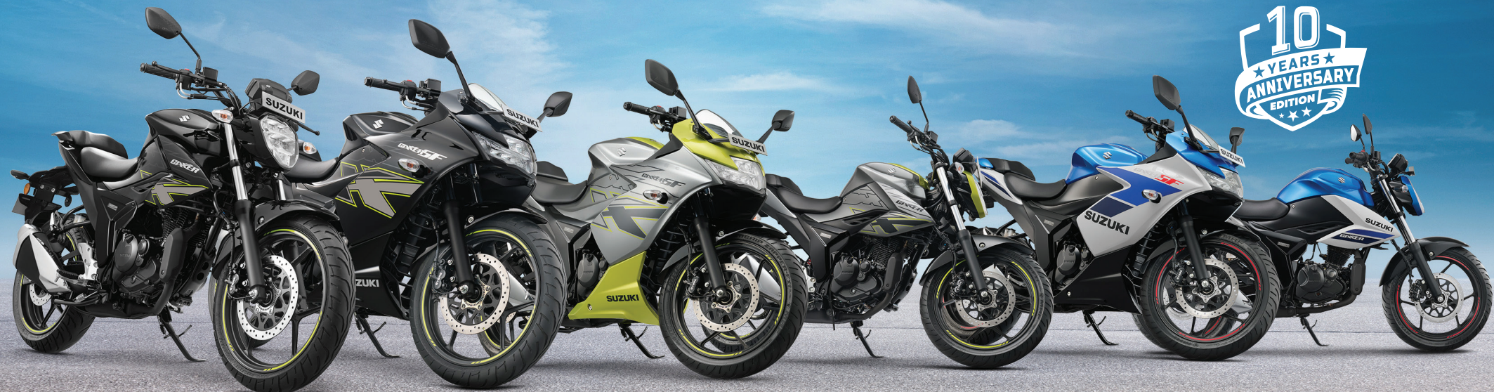
Gloss Sparkle Black